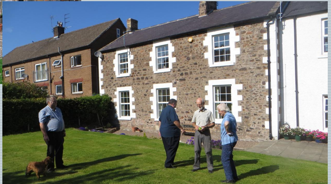
Roddam Dene House